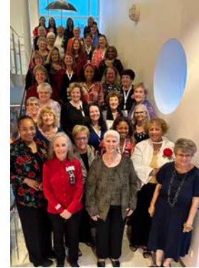
To the Left: American Members in Finland