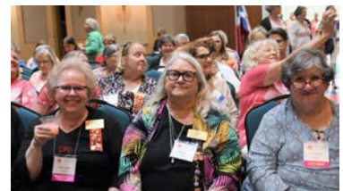
Sipping Border Buttermilk and awaiting the Opening Session.