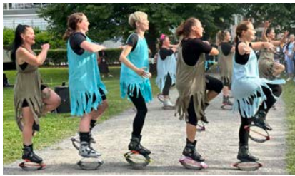
Below: Hopping Shoes Dancers

The opening night session included welcome messages from Tampere dignitaries and DKG leaders as well as a delightful performance by a local female musical trio. Members then traveled via bus to a reception and tour at the Vapriikki Museum Centre in Tallin. In addition to enjoying native appetizers and drinks, they reconnected with friends from other countries and visited the Once Upon a Time, a Story of the Origins of Fairy Tales exhibit.