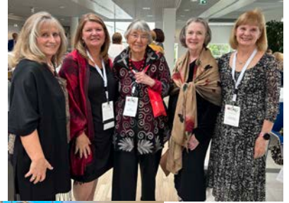
Above: Texas Members in Finland

Coffee breaks between sessions were planned with activities to help members meet someone new. In breakout sessions, time was given at the end for questions and conversation. The Forums met independently (US, Canada, and Europe) for one hour and then gathered together to have an interactive discussion on Happy Teacher, Happy Student and how the two intertwine. Tampere Hall was a beautiful venue connected to the conference hotel that made it easy for people to continue conversations at the end of each day. Throughout the conference people exchanged ideas, contact information and a lot of hugs. Meaningful connections were definitely made!