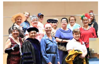
ASTEF's model directors