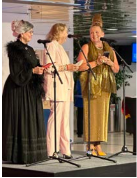
Above: Past, Present and Future Teachers

The DKG International Conference in Tampere, Finland provided a dynamic balance of speakers, cultural experiences, and networking time. In addition to the theme of Moving Forward with Vitality, Relevance, & Sustainability In Our Changing World , there was an emphasis on making meaningful connections.